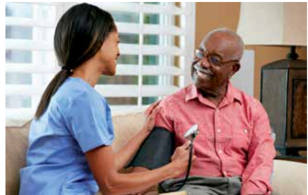
Fig. 1-1. Home health care takes place in a person's home.

care will be cared for in their homes by a home health aide (HHA) or other home care professional (Fig. 1-1). This type of care is called home health care .