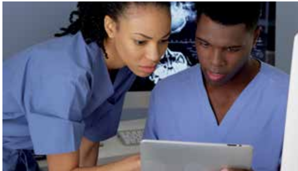
Fig. 1-2. Technology makes it possible to offer better health care, but equipment can be expensive.

The healthcare system is constantly changing and with these changes come new costs. New technologies and medications are being created, and better ways of caring for people in a wide variety of healthcare settings are being developed. Better health care helps people live longer, which leads to a larger elderly population that may need additional health care. New discoveries and expensive equipment have also increased healthcare costs (Fig. 1-2).