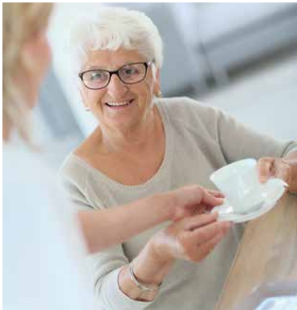
Fig. 1-6. In a client's home, the HHA is a guest and must respect the client's personal items and customs.

Client's comfort: One of the best things about home care is that it allows clients to stay in the familiar and comfortable surroundings of their own homes. This can help most clients recover or adapt to their condition more quickly.