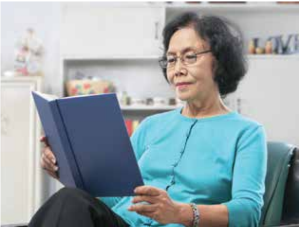
Fig. 1-3. People who are ill or disabled often feel more comfortable being cared for in their homes, where everything is familiar.

Most people who need some medical care prefer the familiar surroundings of home to an institution (Fig. 1-3). They choose to live alone or receive care from a relative or friend. Home health aides can provide assistance to the chronically ill, the elderly, and family caregivers who need relief from the physical and emotional stress of caregiving. Many home health aides also work in assisted living facilities. Assisted living facilities allow independent living in a home-like environment, with professional care available as needed. Home health aides may be former nursing assistants who decided to make a change (and were qualified to do so) from working in facilities or hospitals to working in the home.